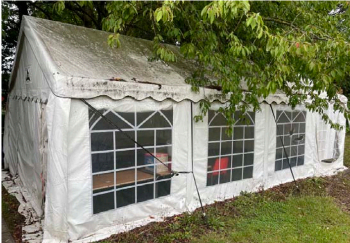
Gala Tent 8m x 4m approx temporary tent, sectional, removal panels, white