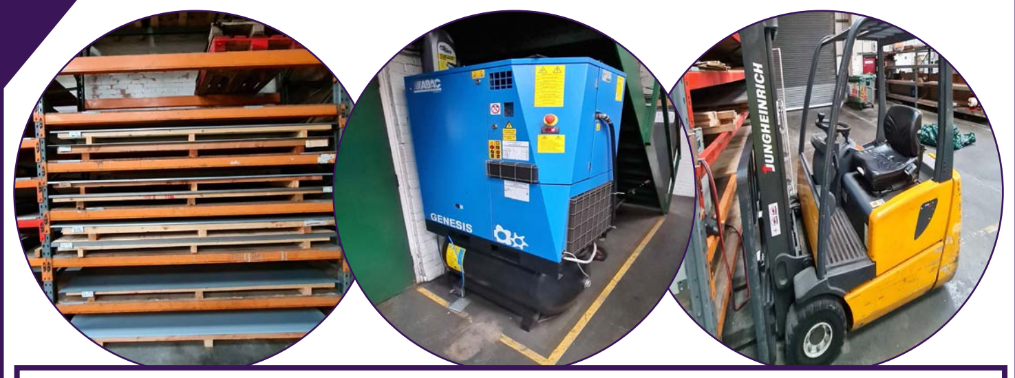
ON-LINE AUCTION DATE: THURSDAY 7th MARCH 2024